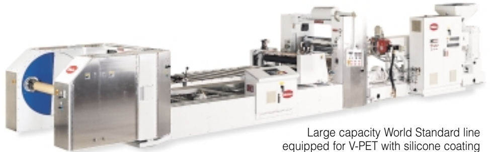
Large capacity World Standard line equipped for V-PET with silicone coating bath and indexing turret winder.

850 Jolly Road, Blue Bell, PA 19422 U.S.A. www.welex.com • E-mail: welex@welex.com Tel: 215-542-8000 • Fax: 215-542-9841